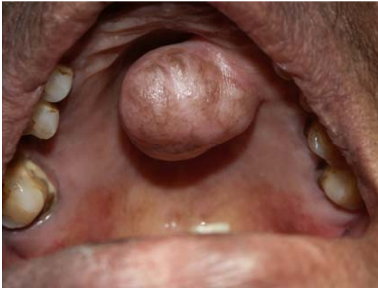
Figure 1 Intra oral view of the swelling.

removal. The wound had healed uneventfully. Patient was followed up for six months without any signs of recurrence.