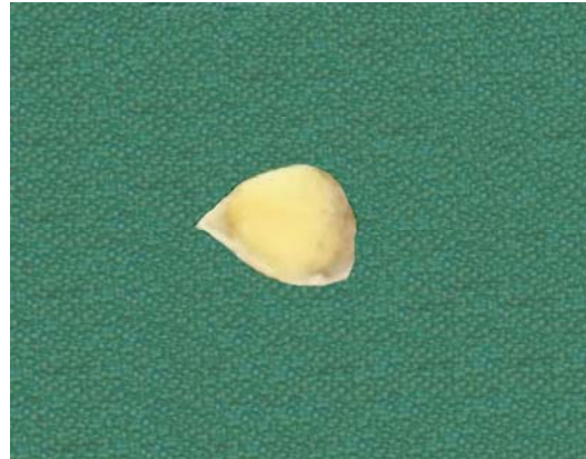
Figure 2 The resected specimen.