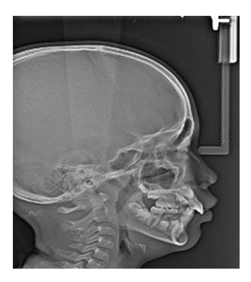
Fig. 3 Pre-treatment lateral cephalometric radiograph.