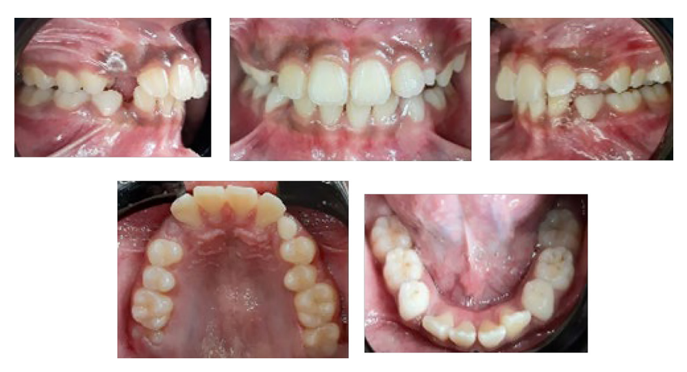
Fig. 6 Post-treatment intra oral photographs.