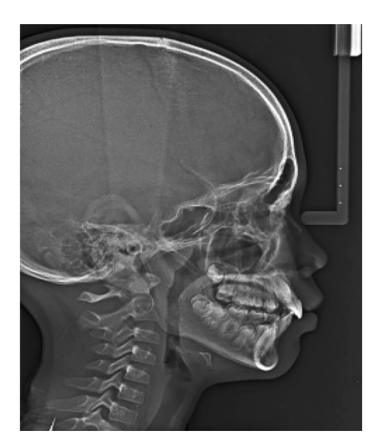
Fig. 7 Post-treatment lateral cephalometric radiograph.