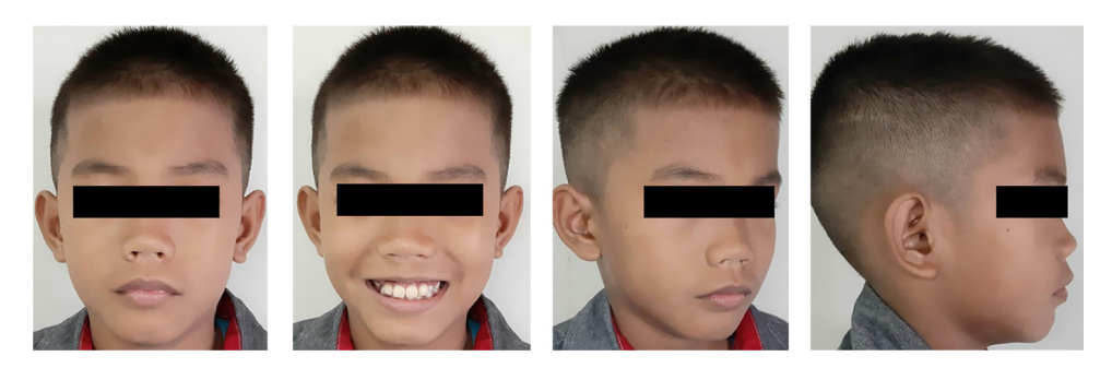
Fig. 5 Post-treatment extra oral photographs.

CASE REPORT | Malocclusion Treatment with Twin Block and Lip Bumper Appliances