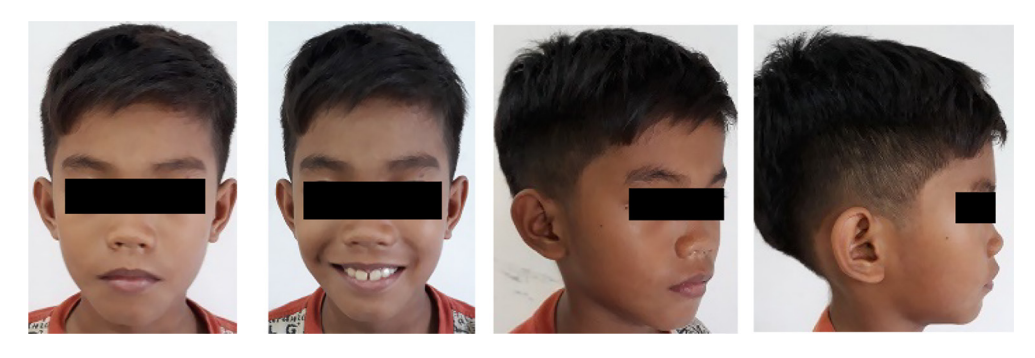
Fig. 1 Pre-treatment extraoral photographs.

On the psychosocial aspect, the patient had lower lip sucking habit. Mentalis muscles were becoming more hyperactive, abnormal of frenulum labialis and sulcus labiomental is getting deeper because of the sucking habit until recently. Cervical vertebrae maturity indicators (CVMI) confirmed the clinical finding of CVMI-1, the initiation stage of cervical vertebrae (Singh, 2015). The stage C2, C3, and C4 inferior vertebral body, borders were flat, superior vertebral borders were tapered from posterior to anterior (wedge shape) and 80% to 100% of pubertal growth remains (Fig. 3) (Singh, 2015). The cephalometric radiograph analysis (Table 1) confirmed the clinical finding of skeletal Class II with a retrognathic mandibular, SNA (sella, nasion, A point) angle of 77.5°, SNB (sella, nasion, B point) angle 73.0°, ANB (A point, nasion, B point) angle 4.5°, both upper and lower incisors were proclined (Fig. 3).