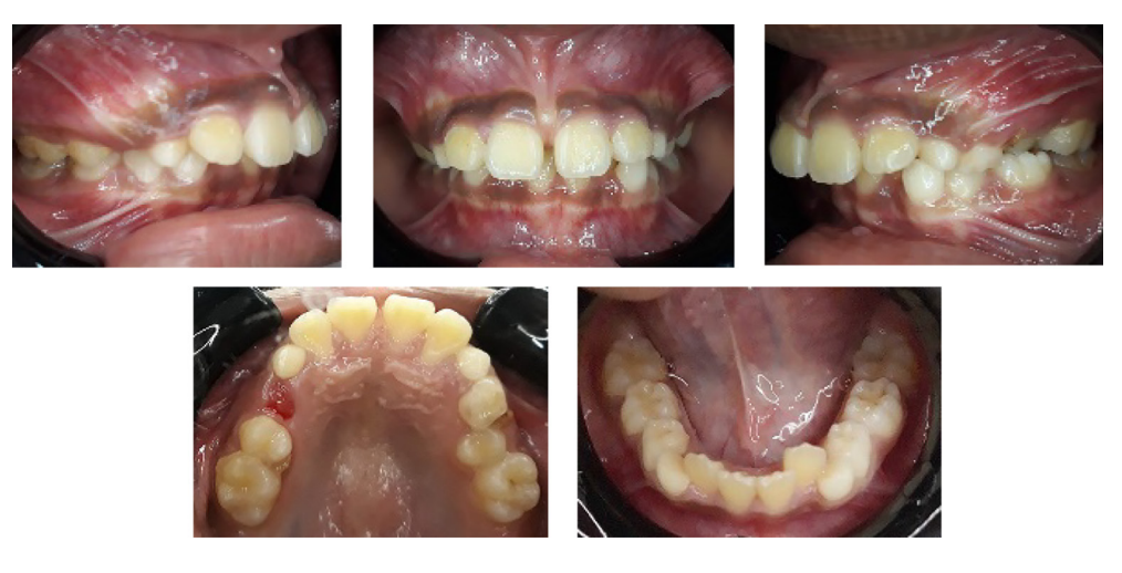
Fig. 2 Pre-treatment intraoral photographs.