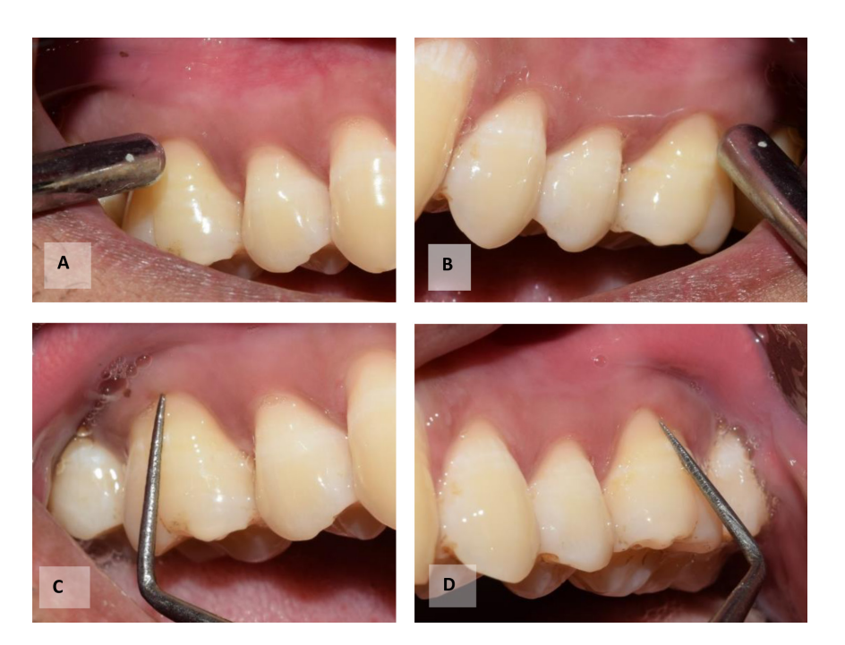
Fig. 2 Evaluation of patient's response to air and tactile stimulus. (A) and (B) Air blast using three-way syringe at test and control sites, respectively; (C) and (D) Tactile stimulus provided using straight probe at test and control sites, respectively.