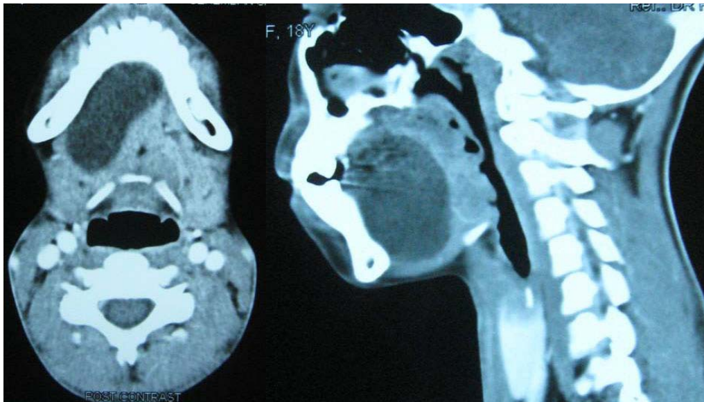
Fig. 2 CT scan showed hypodense swelling at the floor of the mouth measured 2 x 1 cm.