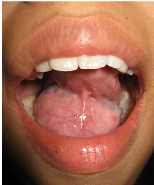
Fig. 1 Photograph showed swelling at the floor of the mouth. The wall appearance is not translucent.

Post-operative recovery was uneventful. Histopathology examination reported as epidermal cyst (Fig. 3). On the initial follow-up, 2 weeks post operation, she has no more complaint of discomfort in swallowing as well as in speech articulation. The patient was followed-up for 3 year with no signs of recurrence.